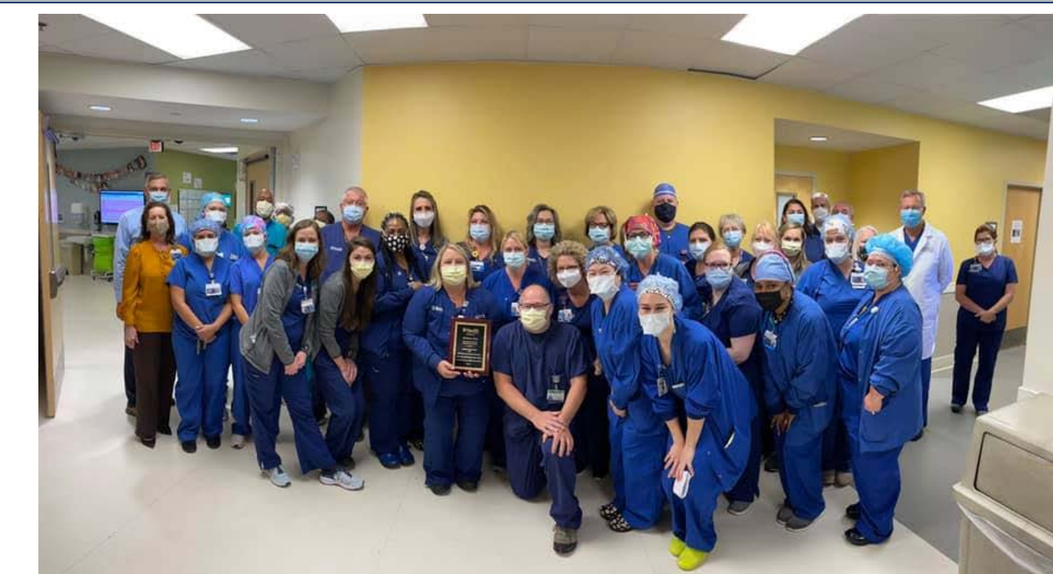
AUHS Teamwork Award for Excellence in Care Through Teamwork: Perioperative Services, May 2021.