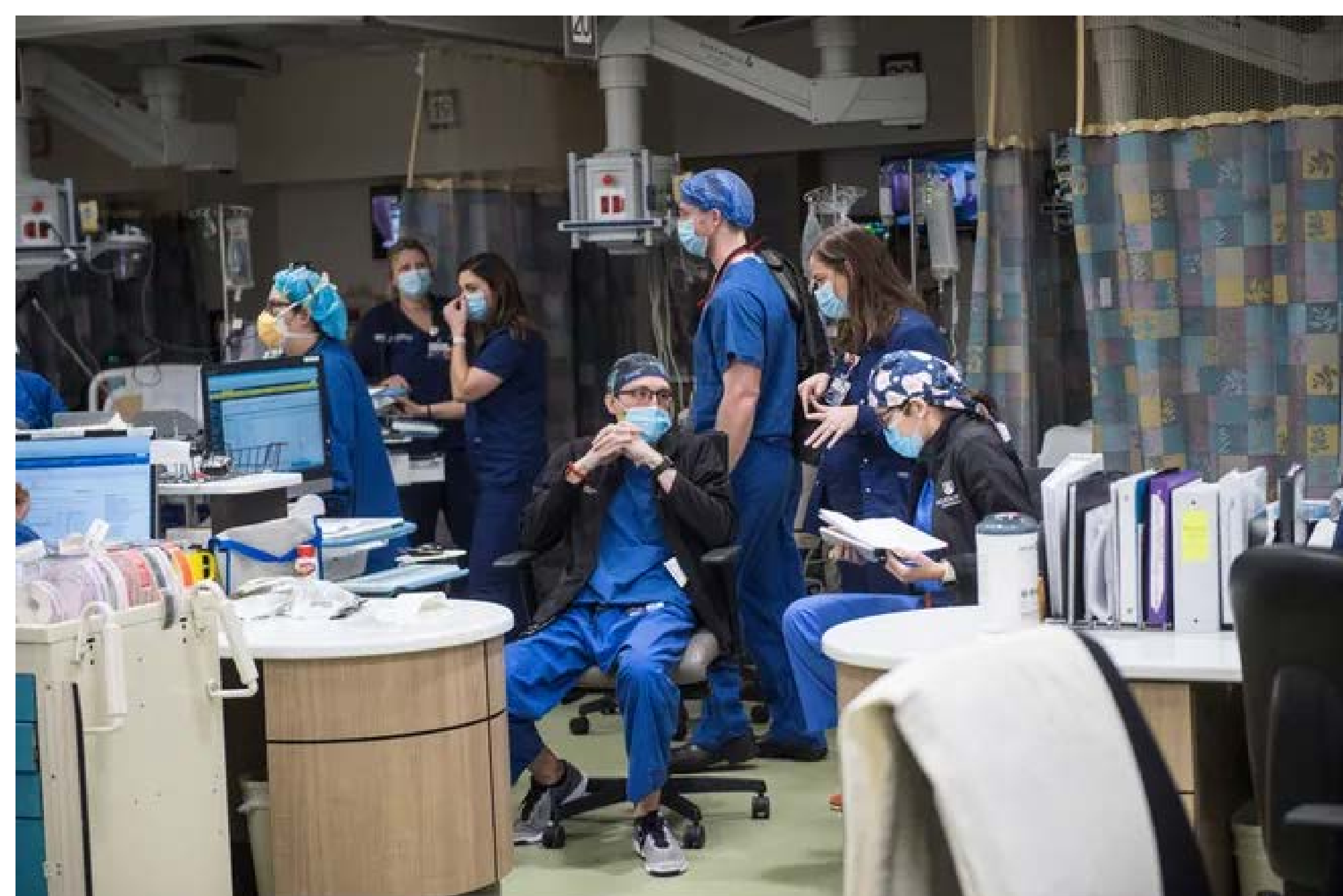
Medical personnel work in the crowded temporary PACU ICU at the Augusta University Medical Center in Augusta, GA, Thursday afternoon January 14, 2021.

Interdisciplinary Partners: Medical Staff, Pharmacy, Dietary, Respiratory, Radiology, Rehabilitation Services, Hospital Transport, Environmental Services, Hospital Safety and Security